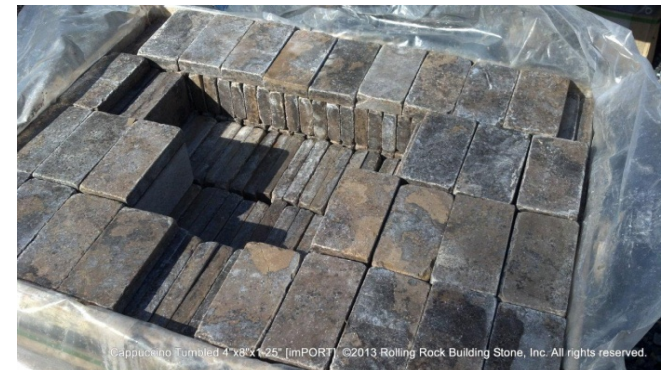
Cappuccino Tumbled 4"x8"x2" [imPORT] ©2013 Rolling Rock Building Stone, Inc. All rights reserved.

Custom: On larger jobs with proper planning and advance notice we can order special sizes or custom fabricated material from the factory to meet job specific requirements in an effort to reduce on site time and labor and reduce overall project cost. Please consult a sales representative for more information.